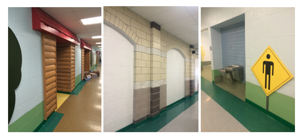
<u>Ceilings:</u> Ceiling materials include acoustical tile ceilings and exposed roof deck. Large Group Instructions are exposed wood trusses with wood attached to the underside of the roof deck. All are in excellent condition. Routine maintenance should be anticipated.

Interior Walls: Interior walls range from a variety of materials, but are generally concrete masonry units with applied finish materials. All are in excellent condition. Routine maintenance should be anticipated.