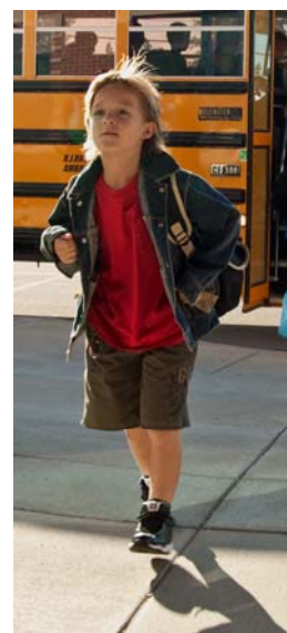
“Back to school!”