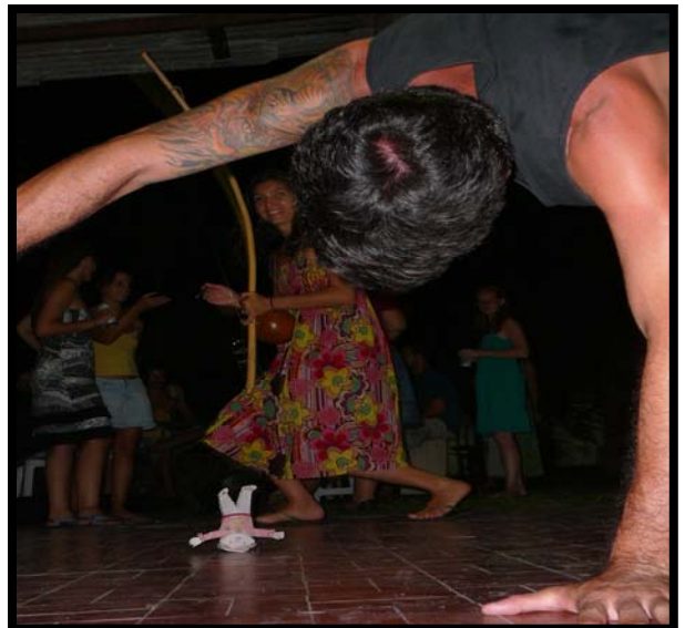
Flat Stanley dancing in Manaus