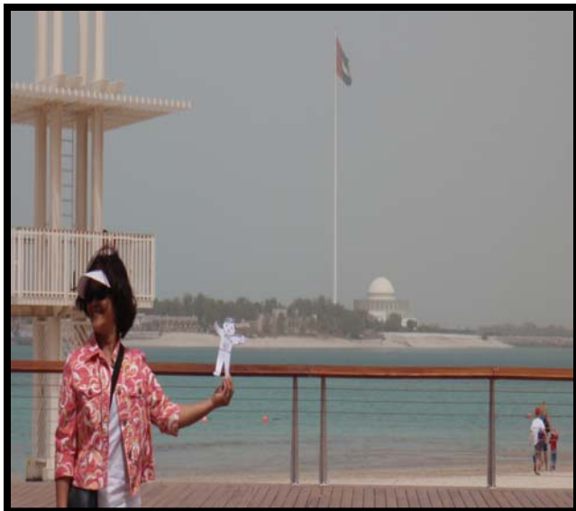
Flat Stanley in Abu Dhabi

Second graders are looking forward to more communication from the friends of Flat Stanley. Our pal has been cited in United Arab Emirates (Abu Dhabi) and in Cleveland, Ohio so far. He also had fun dancing at a party in Manaus, Brazil, with some good friends of his! Many students are also taking Flat Stanley with them as they go through their weeks at home. Flat Stanley is looking forward to spending Spring Break with a lot of people! Children are journaling about his escapades! By the time you are reading this, there will be a lot of other Flat Stanley sightings. Later this month, the students will attend a play, The Frog Prince , at Penn State Beaver Campus on April 22. The performance is at 10:00 AM that morning. We hope the students enjoy the talents of the Penn State Student Theater Group.